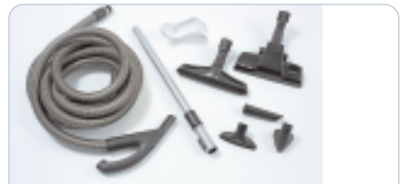
Accessory kit with hose