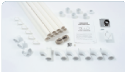
Pipe kit with wall inlets